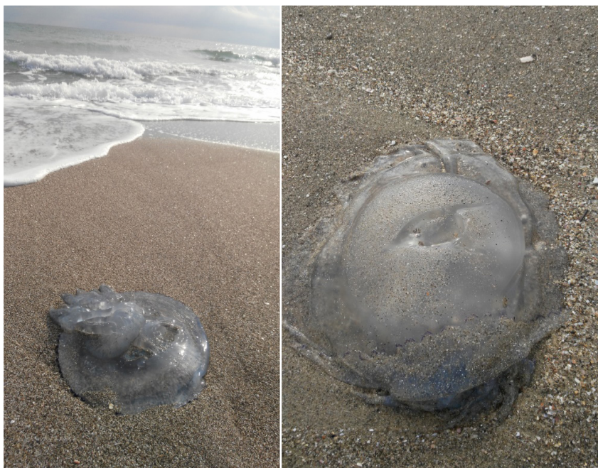
Fig. 4. Specimens of barrel jellyfish partially eaten by a Grey Plover.

scyphozoan medusae by Grey Plovers in the Western Palearctic.