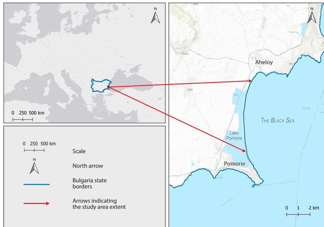
Fig. 1. The study area in relation to Europe and Bulgaria. (Esri Topographic Basemap)

The study area ( 42^{\circ}36'17.9''\text{N} 27^{\circ}37'50.0''\text{E} , Fig. 1) is situated at the Pomorie sand shore between Lake Pomorie (or Pomoriysko Lake)