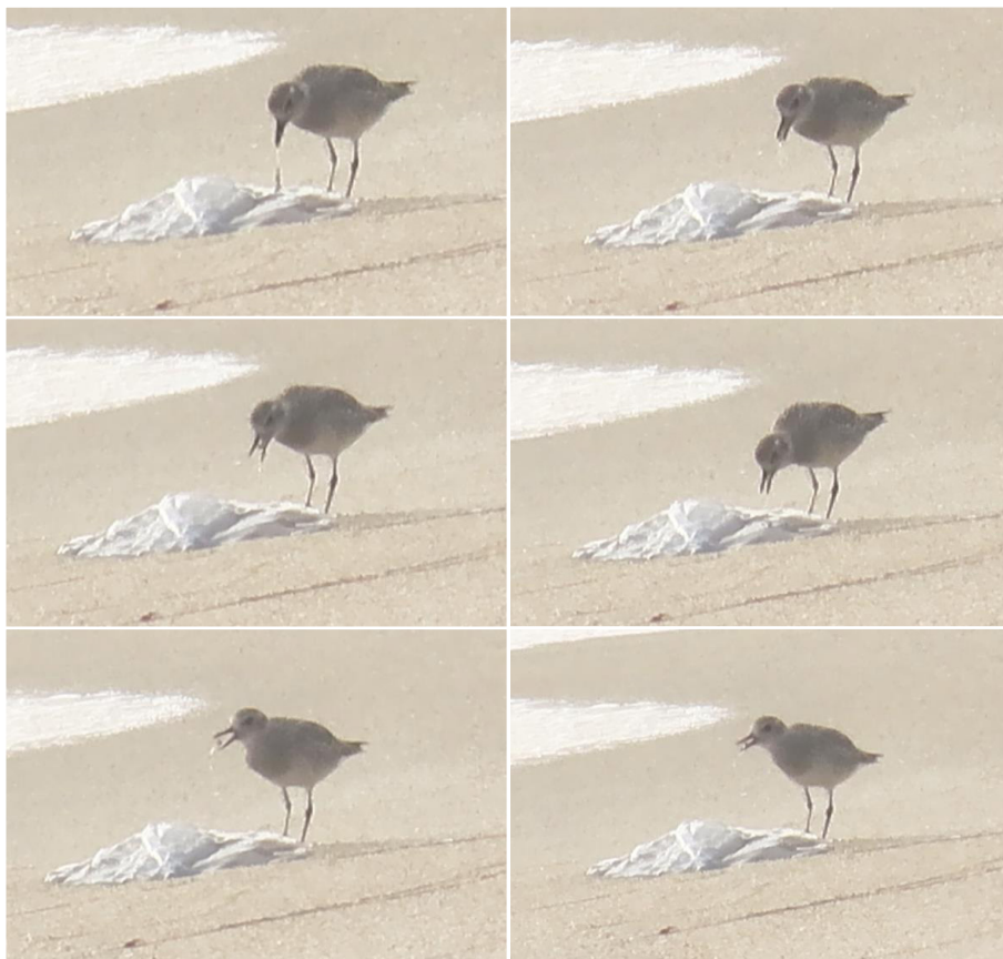
Fig. 3. Screenshots from video, depicting how a Grey Plover is feeding on barrel jellyfish.

Prey quality and availability is vital for bird survival. Hence, foraging behaviour and diet composition are of key importance for understanding the ecological role and trophic relations of birds. The multiple video-documented observations in the present study provide evidence that scyphozoan jellyfish Rhizostoma pulmo are deliberately chosen and taken by Grey Plovers as food items. Therefore, true jellies can be considered part of the diet of Grey Plovers on the Black Sea coast. This is the first report of proven consumption of