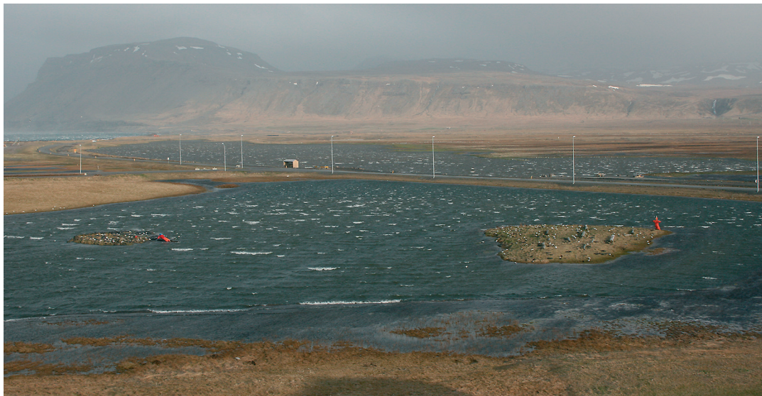
Fig. 1. The Common Eider colony at Rif, western Iceland. View from the north-eastern side of the 2.34 ha pool on 12 May 2009. Note the larger waves, caused by the deeper water surrounding the rocky island on the left, compared to those surrounding the grassy island on the right. Spring-season water levels were high when this picture was taken and the ditch for the grassy island was flooded (far right; see text).

tion; and (c) harsh winter conditions are unfavorable for depositing fat reserves and they affect most females. Our assumption that body condition in the Common Eider varies between years within individuals (and can thus respond to variation in winter weather) is supported by findings of Öst et al. (2007), who reported that such variation represented 59.1% of the total variation, compared to 40.9% for variation between individuals.