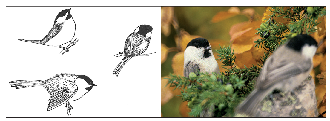
Fig. 2. Three postures frequently used by interacting Willow Tits. Left: two threatening displays; upper, a high-ranked bird tilting its head upwards and exposing its black throat badge towards another individual. This display is silent and extremely brief (filmed and discovered when played back in slow motion). Lowest, a bird fluffing of back feathers with wings dropped and held out from the body and tail spread. The bird at right shows an escape posture: it pull its head and body feathers in tight to the body and lean away from a higher-ranked bird. This escape display has a subduing effect on the aggressor and the bird usually avoids being attacked. The bird at left in the photograph is a dominant that exposes its black throat badge towards a subordinate which adopts the general escape posture.

uously and were rarely observed being chased or supplanted by residents.